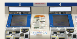
Reserved seat ticket machines

From one month prior to the boarding date.