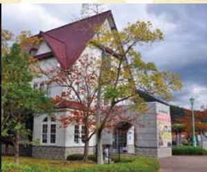
Port of Humanity Tsuruga Museum