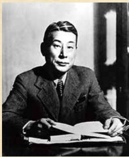
NPO Chiune Sugihara. Visas For Life

Learn about the life and work of Chiune (Sempo) Sugihara, a Japanese diplomat who was appointed as consul in Lithuania during WWII and saved the lives of some 6,000 Jewish refugees by issuing transit visas to Japan, in order to help them flee Nazi persecution. Highlights of your tour include visits to the Port of Humanity Tsuruga Museum, Chiune Sugihara Memorial Hall in Yaotsu, a ryokan (Japanese inn) stay, and a traditional tea ceremony.